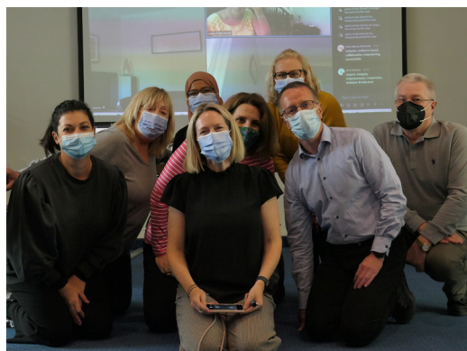
SAFE and members worked together to develop the 2024-2028 strategy