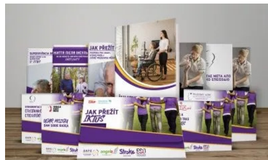
We published 'Surviving Stroke', which is an evidence-based information pack for families and stroke survivors and translated into 12 European languages.

We also attended the World Stroke Congress in Toronto. We attended the Rehabilitation and Life after stroke presentation sessions, we took part in three specific meetings on life after stroke with other global stroke support organisations, and we met specifically with the Canadian stroke support organisation, the March of Dimes, which resulted in a lot of interest in the European Life After Stroke Forum.