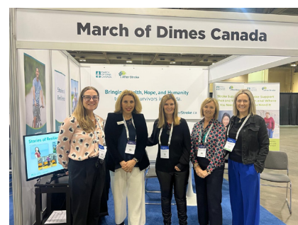
We attended the European Stroke Organisation's conference in Munich with a stand where we networked with key contacts in the stroke community. We also attended the World Stroke Congress in Toronto where we met with the Canadian stroke support organisation March of Dimes.